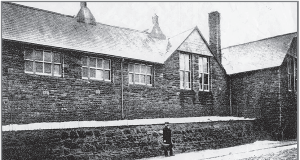
Blaengarw Junior School, built soon after this article.

Our readers are aware that the Garw Valley is developing with wonderful rapidity, and as it even now is only in its infancy, unless the question of school accommodation receives due consideration at the hands of the authorities, we cannot but deplore the great loss this will occasion the children of workmen in the Garw.