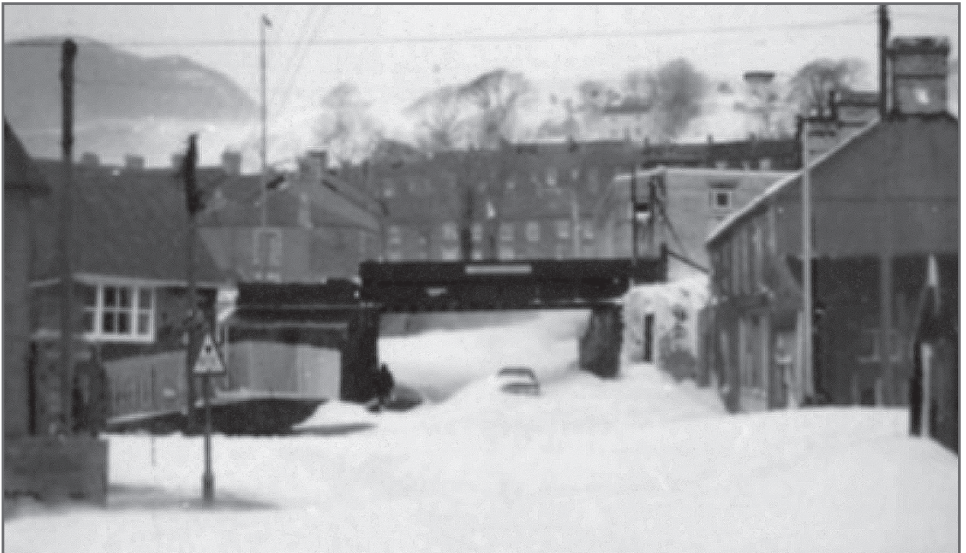
Blaengarw under snow in 1982.