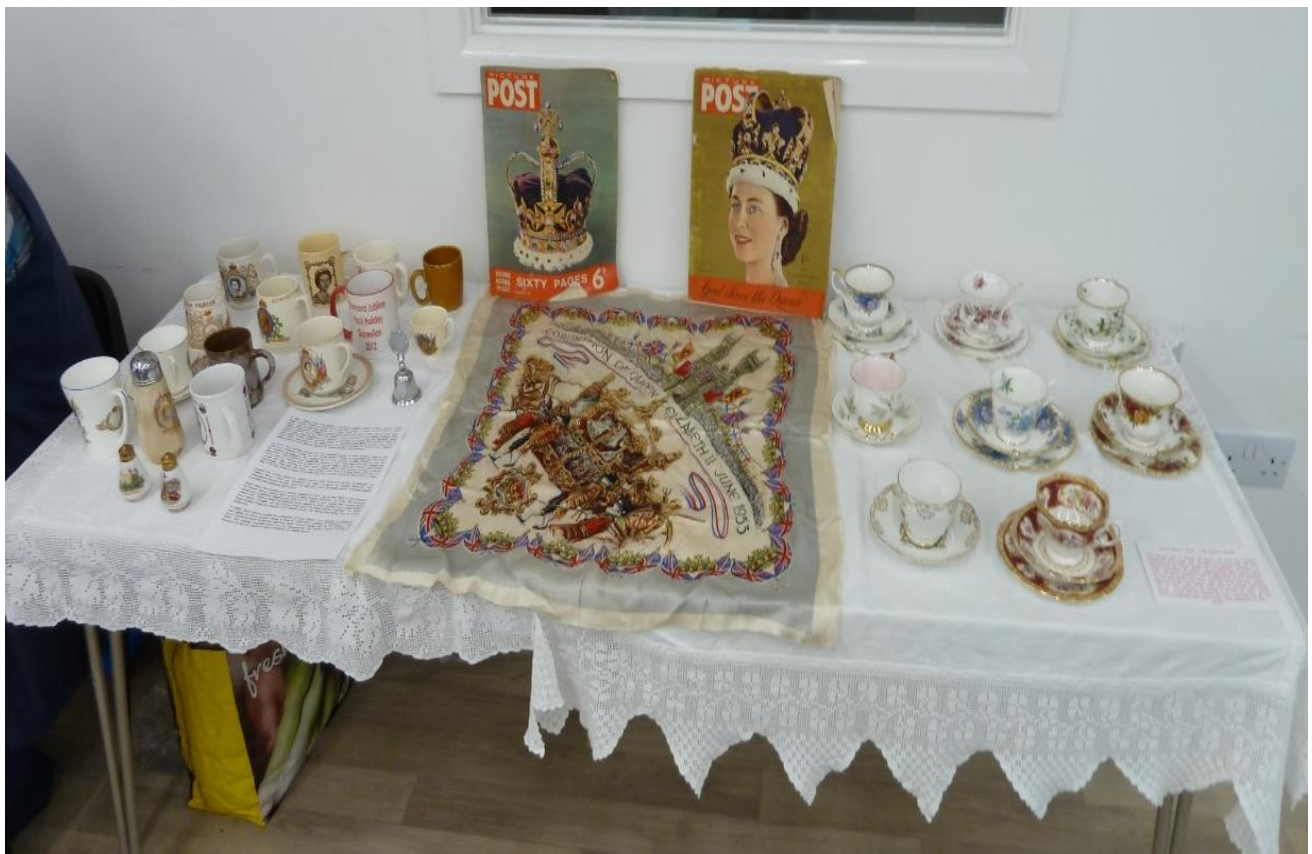
Above and below: some royal memorabilia, coronation china, booklets and programmes, and coins of the realm from pre-decimalisation days.

A stunning photograph by our photographer Colin Simper of a Red Kite over the top of the Garw reminds us of the lovely place we live in. Our back pages include a plea for new members, and a precis of the GVHS history, a society formed 15 years ago, and in need of fresh blood to continue the good work.