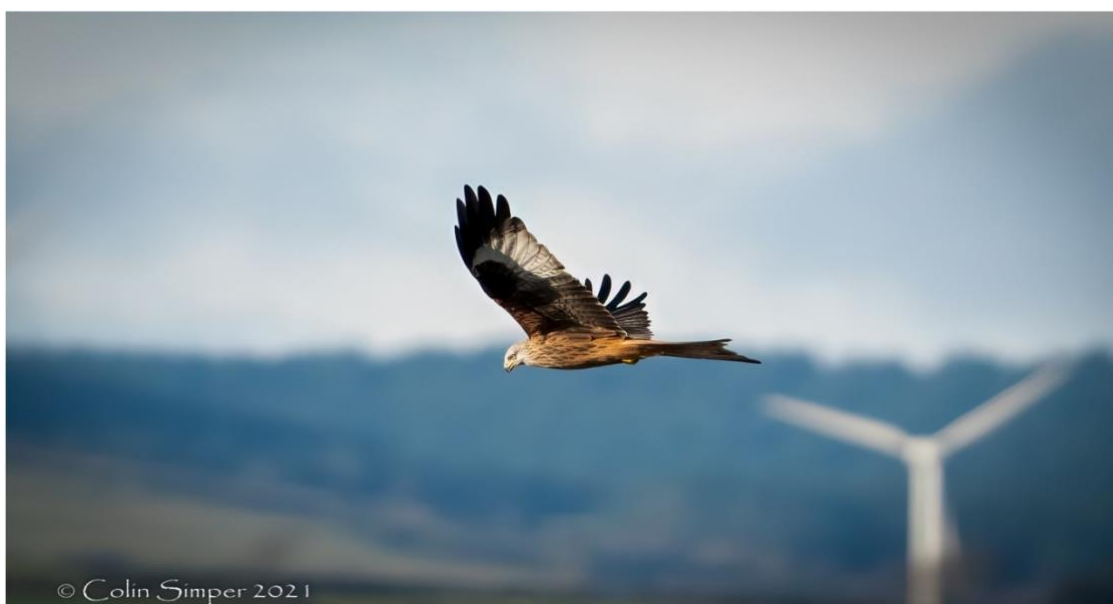
A Red Kite over the Garw