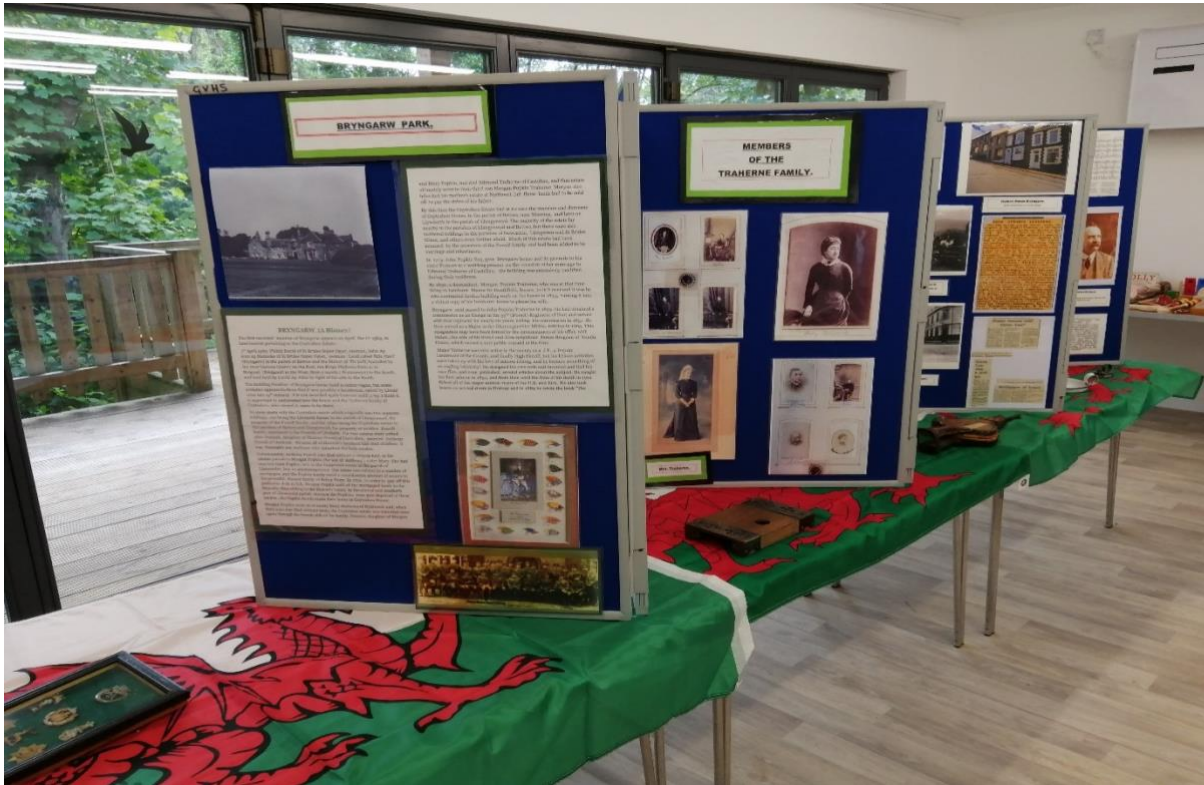
Some history of Bryngarw and the Trehearne family, set up in Y Nyth, Bryngarw Park, before the visitors arrived, on Jubilee weekend.

mention and what not to mention. Every inch of ground from Llwyniorath and Nantymwth to Ton y Bettws is sacred to me. Well I remember plodding through the snow and sleet, on the back of my grandfather's old mare 'Brown,' to the 'old' mill at Pandy, where our corn was ground and was subsequently made into good 'Bara gwenith.' I have benefited in good health until this day having been fed on it.